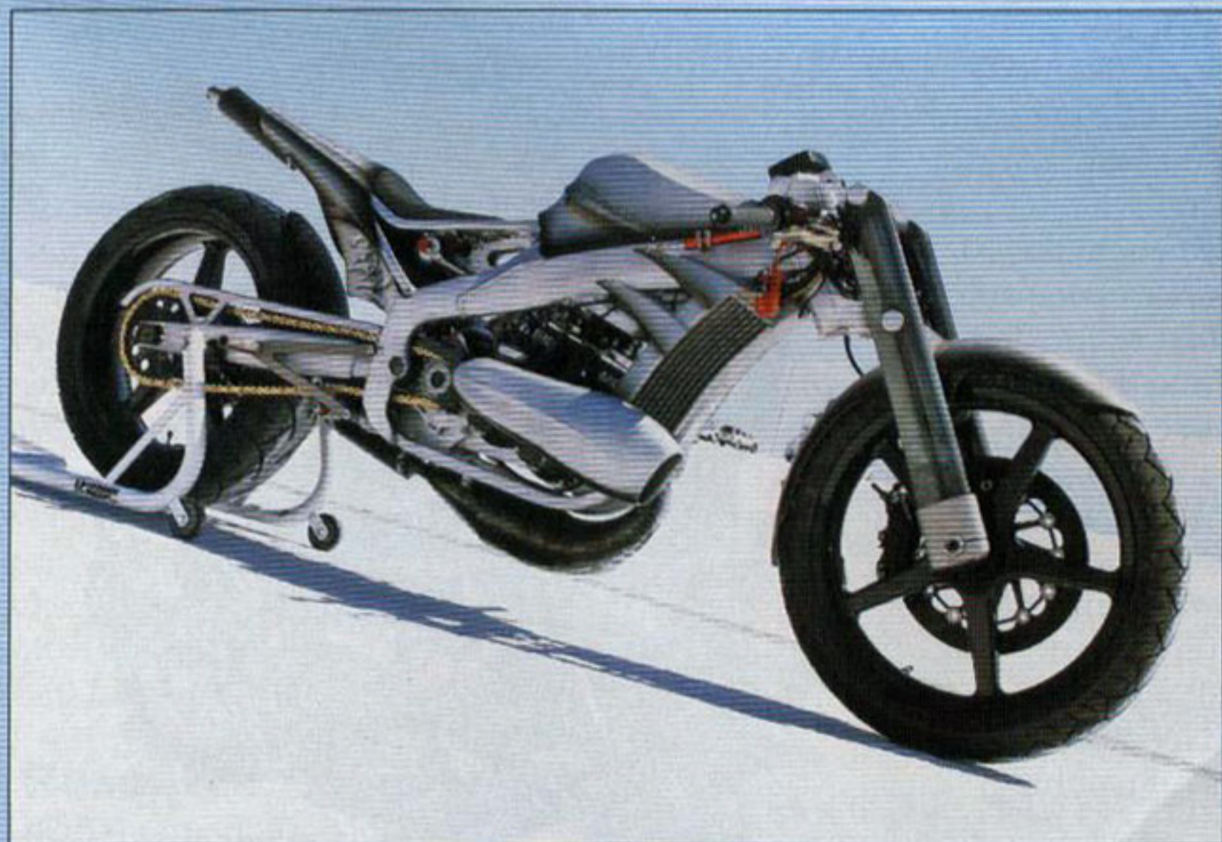
Roger Goldammer built this Rotax inline two-stroke to run against Matt Hotch's 1000cc Vincent custom that boasted electronic fuel injection. Goldammer's chassis is based on a modified Honda motocross frame.