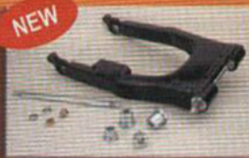
Kits now available to adapt late model swingarms