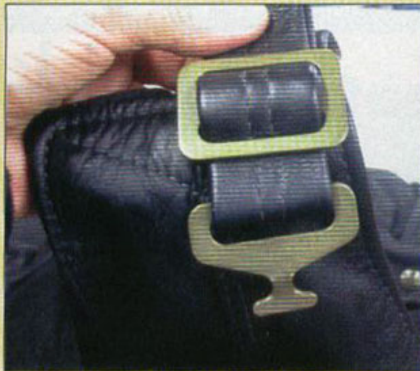
All of Stone Lake's brass hardware is die-cut and finished in house.