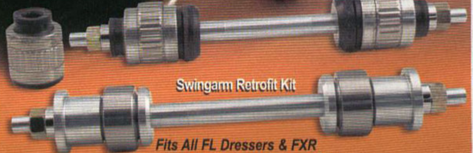
Swingarm Retrofit Kit

Fits All FL Dressers & FXR Models From 1980 Through 2001