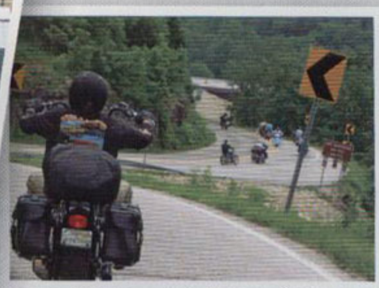
HOW TO RIDE 100,000 MILES