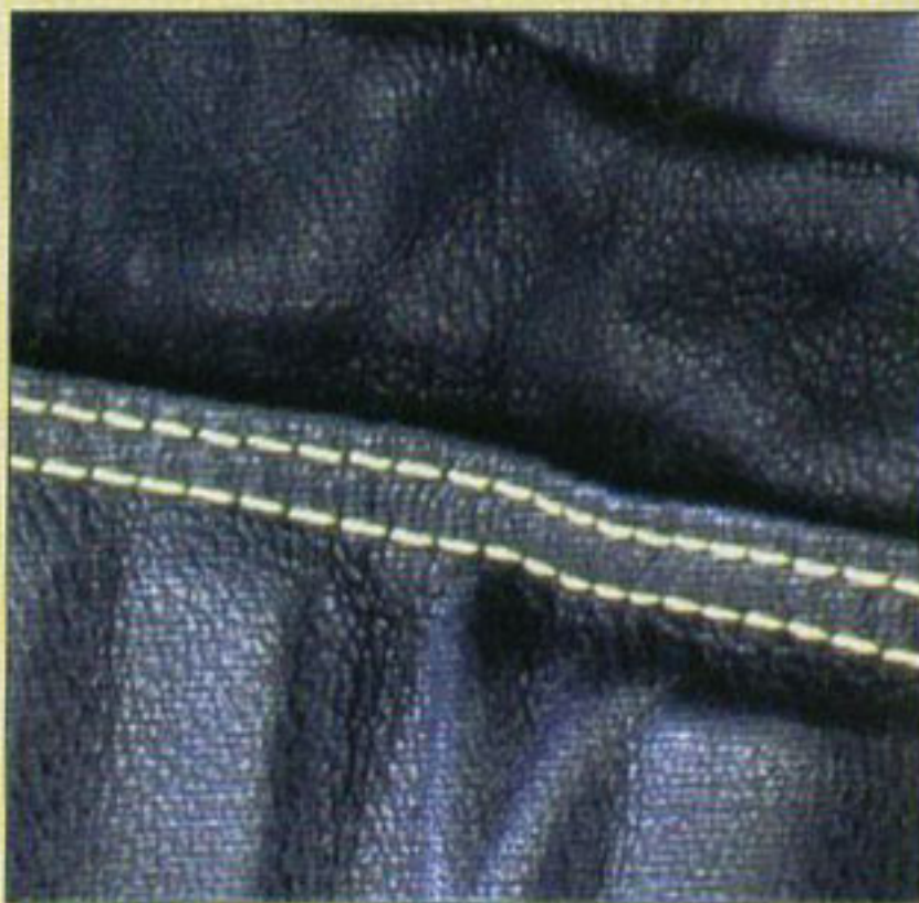
Stitching is guaranteed for five years. This customer requested yellow stitching.