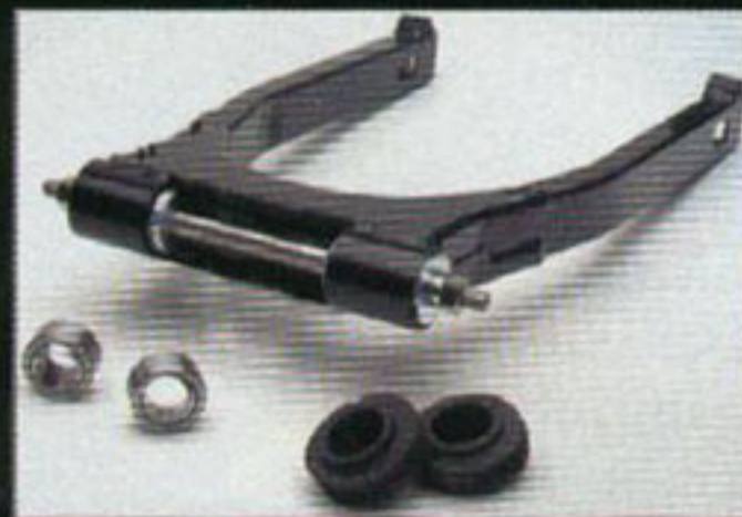
Swingarm with Retrofit Kit Installed

Dramatically Improves Handling and Tracking