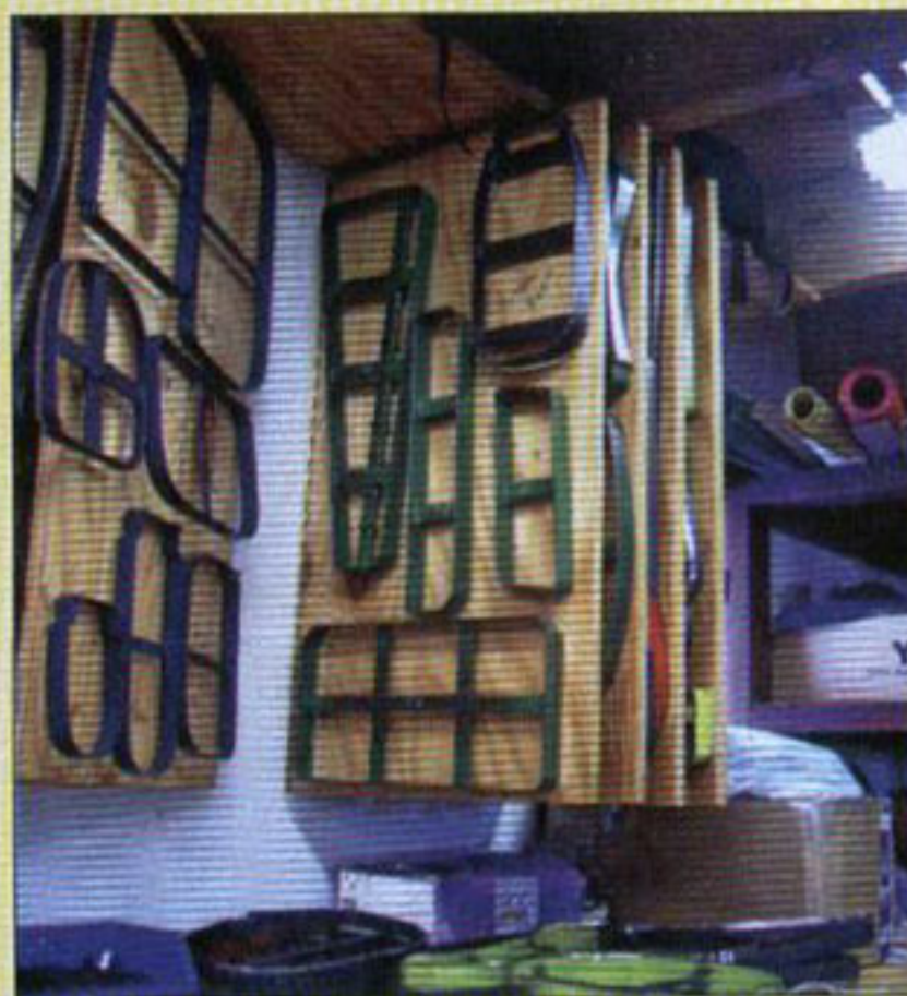
Steel die patterns are used to cut out the leather components.

The Rogers' business actually took off when Dan began making