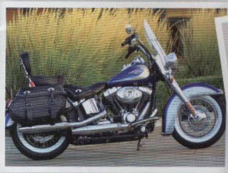
2009 HARLEYS HAVE ARRIVED